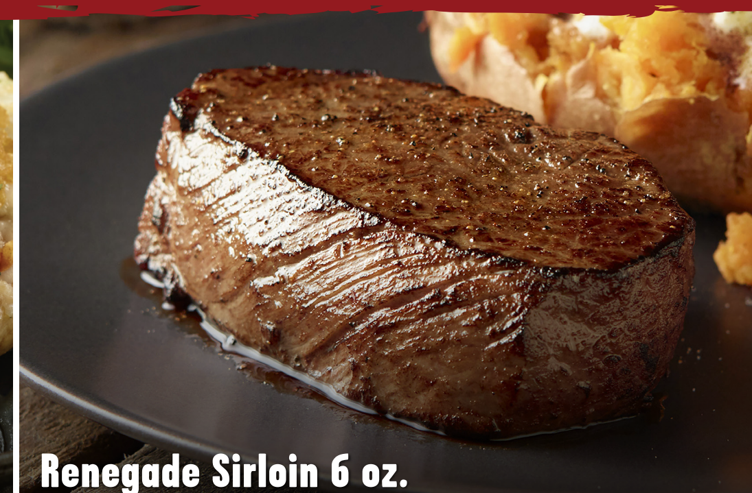
Renegade Sirloin 6 oz.

Choose your favorite meat with vegetables covered with our emblematic BBQ sauce, served on a bed of rice. Chicken & pork sausage or Sirloin and pork sausage. Substitute rice for your favorite side. Upgrade to Shrimp Skewers with pork sausage for + $2 p/p.