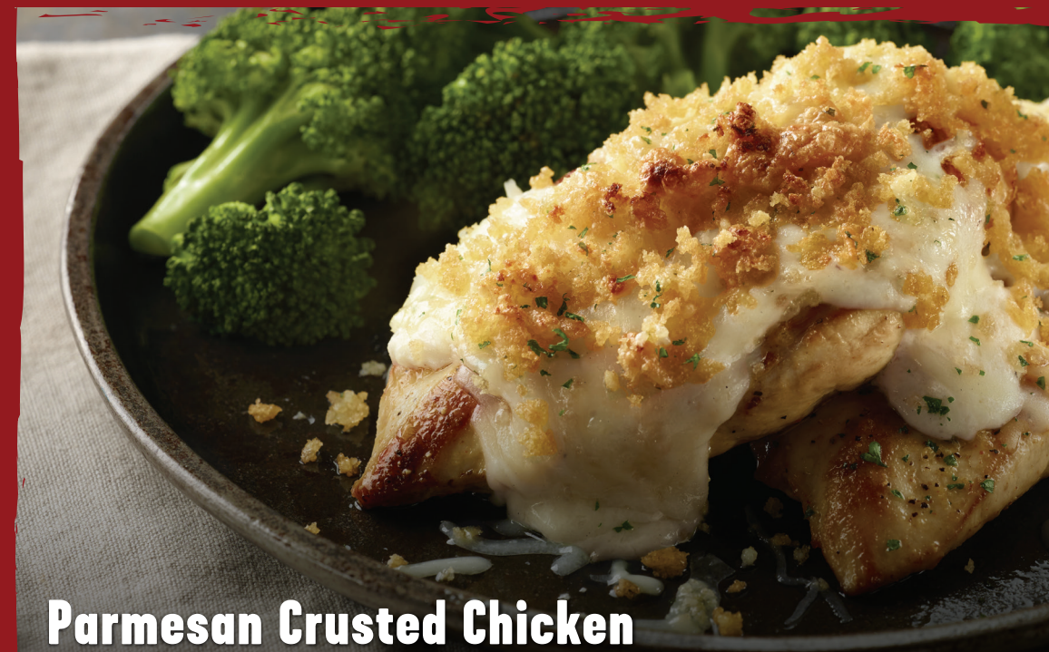
Parmesan Crusted Chicken